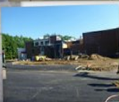
Paving in parking lot