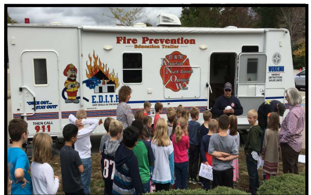
WES students learn about the importance of smoke detectors

Thank you, Wells Fire Department , for everything you do to keep our campus and community safe!