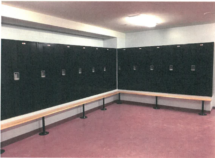
Varsity Team Locker Room