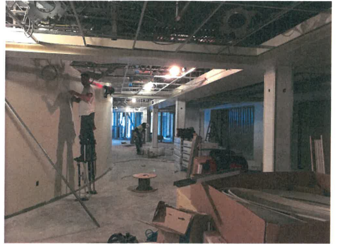
Cafeteria/Performing Arts Center