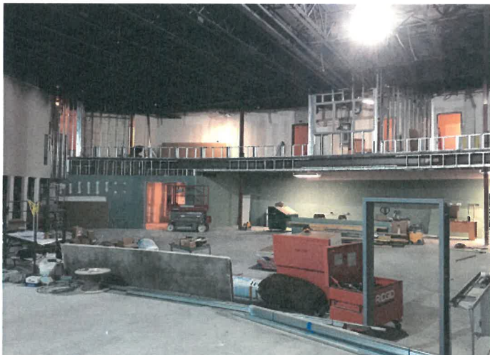
Auditorium/Performing Arts Center