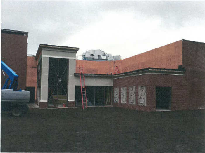
Entrance to Performing Arts Center