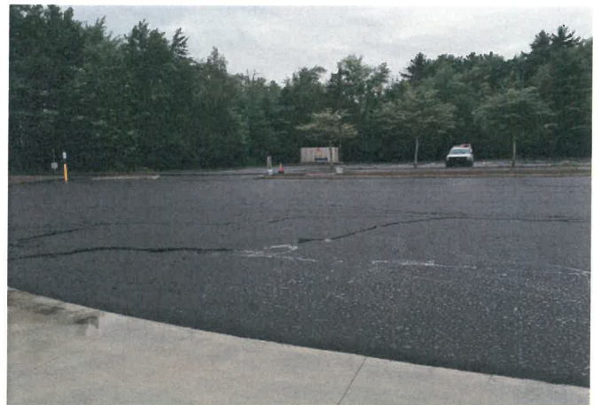
Newly sealed Parking Lot