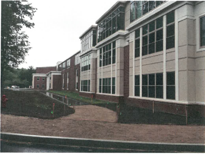
Landscaping in front of building