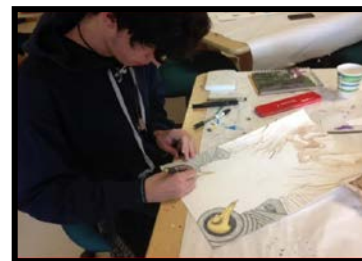
Storm creating a drawing in his class