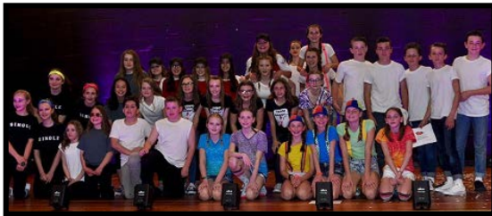
Participants in the 2017 Lip Sync

Wells Jr. High School is honored to donate $1,000 to this great organization.