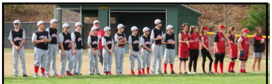
Wells Junior High baseball and softball teams during the WOLL Opening Day festivities.