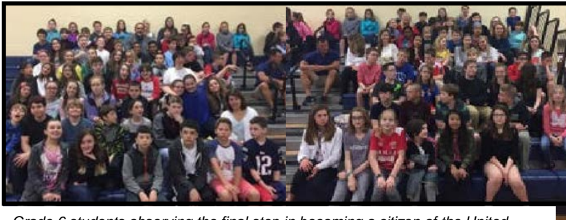
Grade 6 students observing the final step in becoming a citizen of the United States.