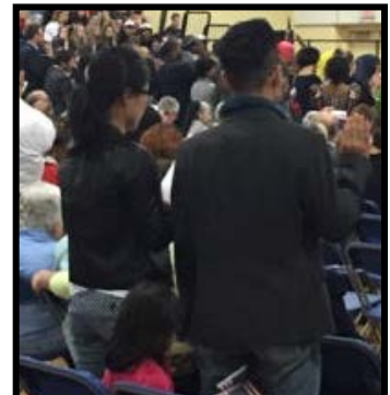
Two new US citizens are sworn in at the ceremony