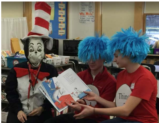
The Cat in the Hat with Thing 1 and Thing 2

National Read Across America Day is a reading celebration that takes place annually on March 2 nd to commemorate Dr. Seuss' birthday. At Wells Elementary, classrooms were abound with Dr. Seuss characters and many guest readers sharing stories with the students!