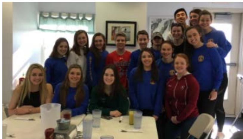
Helping out those in need!