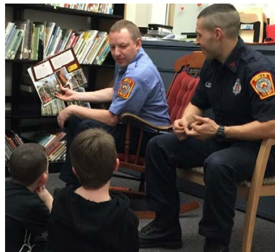
Members of Wells Fire Department share a story about fighting fires!