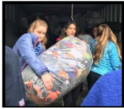
Volunteers collecting donations

When they say "It takes a village..." they were not kidding!