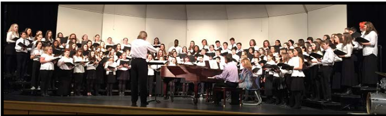
Southern Maine Middle School Honors Music Festival Full Chorus