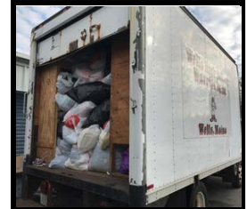
The Band Van is loaded!

--and.....we raised over $5,000 !!!! Thank you!