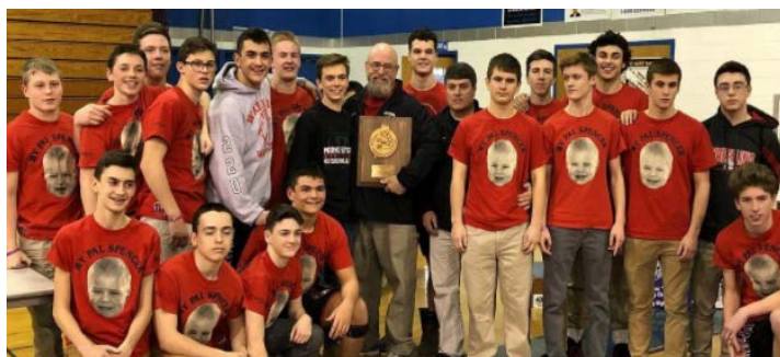
The Warriors hope to defend their 2017 State Championship title!

If you enjoy wrestling competitions, then WHS is the place to be this Saturday as the Warriors host the 2018 Class B Wrestling State Championship event.